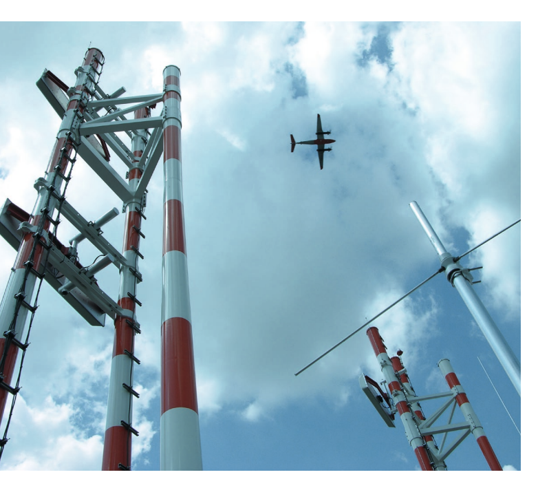
Glide Slope Transmitter Frankfurt Airport, Runway Northwest

Both the construction of large, modern buildings with innovative facades and complex geometry and wind energy plants with their rotating blades can lead to the impairment of navigation and surveillance facilities. They can have a detrimental effect on the performance of Air Traffic Control facilities, which in turn might endanger the safety of flight operations, especially near aerodromes. These constructions may generate unintentional reflection, refraction or attenuation resulting in malfunctions of these technical facilities (radar, ILS glide slope and localizer or enroute facilities such as VOR). Objects beyond the formal protective areas surrounding these Air Traffic Control facilities can also cause malfunctions according to ICAO EUR DOC 015 (European Guidance Material on Managing Building Restricted Areas).